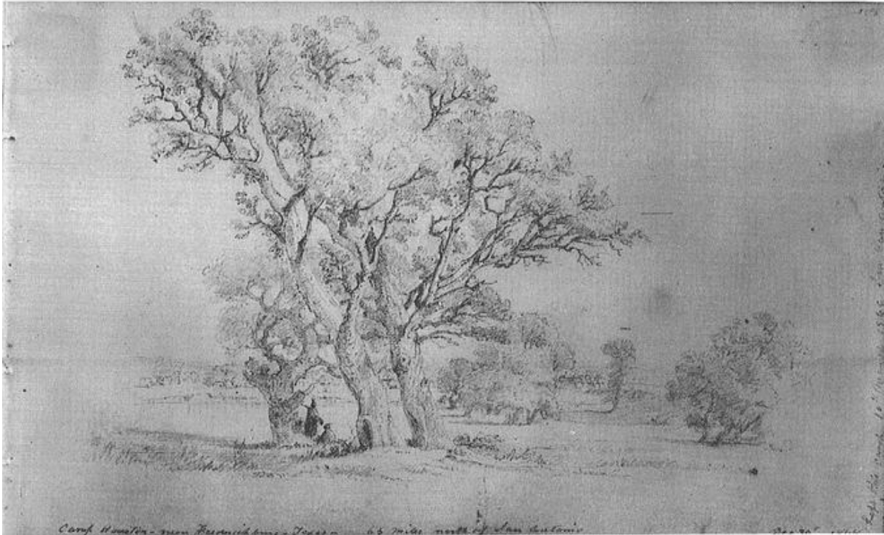
Camp Houston near Fredericksburg, Texas, 65 Miles North of San Antonio, Dec. 1848 by Seth Eastman, 1848. Pencil sketch, 418 x 71/2 inches.